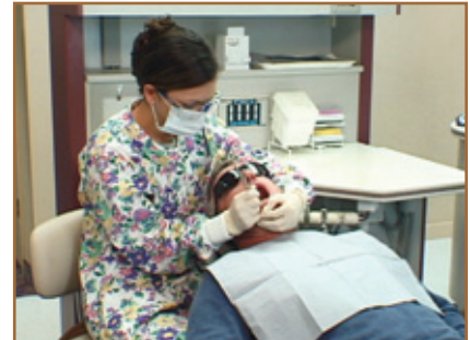
Several appointments are needed