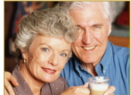
In time, you'll adjust to dentures