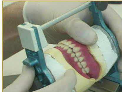
Creating a precise fit